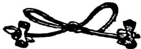
Worn on the brim of Scout hat