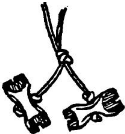
Worn around neck

B-P had got the idea for wearing beads on the hat during the First World War after seeing officers of the U.S. Expeditionary Force wearing broad-brimmed B.P. Stetson hats (not named after Baden-Powell but a Stetson trade name: 'Boss of the Plains') with acorns attached to the two ends of a thong that kept the hat from blowing off the head in a strong wind. He thought originally of having two beads attached in the same way on the Scout hat but changed his mind when it was brought to his attention that Scout Leaders only wore their hats outdoors, so instead he decided that they should be worn on the thong around the neck.