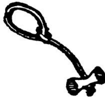
Worn in the button-hole of coat

These sketches by B-P show how the Wood Badge design evolved.